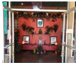
Front of store

I will be back - if only because it is close-by and I really want to like this place.