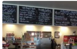
The Daily Grind Espresso Bar and Cafe