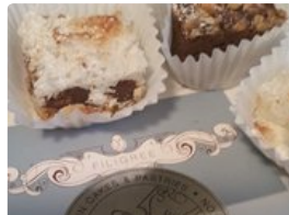
Filigree Cakes & Pastries