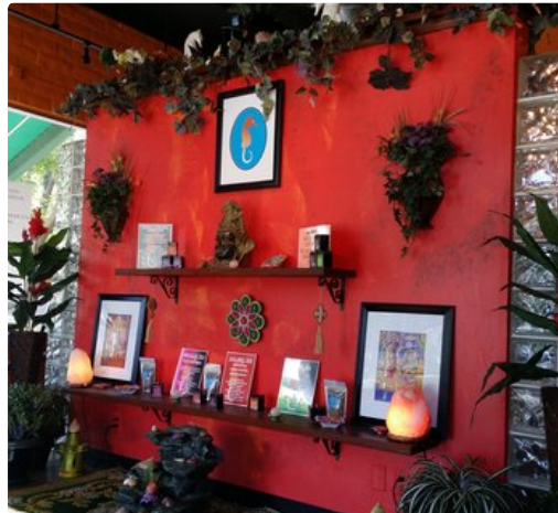
Entrance Display at Bombay Nick's